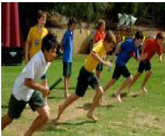
The Year 7 Boys Relay