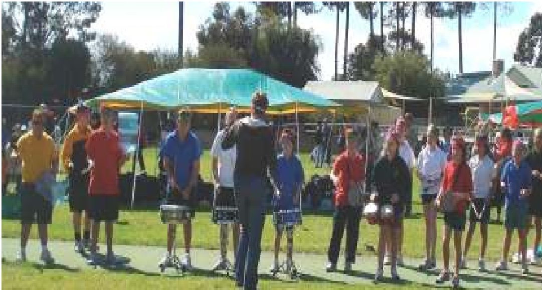
The Samba Band in action!