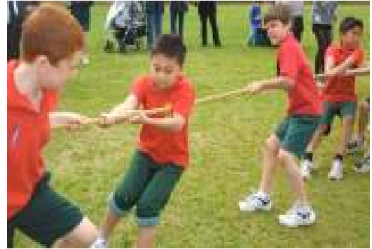
Some of our enthusiastic participants in action at our Faction Carnival enjoying the Tug-of-War competition